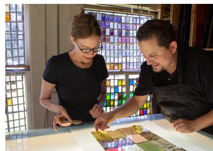
Fragile Thoughts FOREST LAWN MUSEUM GLENDALE, CA

Reception Saturday, August 21, 2021 5:00 - 7:00 P.M. PDT