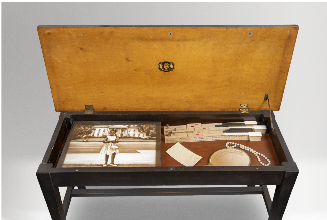
Piano Bench for Condoleezza Rice , piano bench, glass, pearls, piano keys, photograph by Boston Public Library.