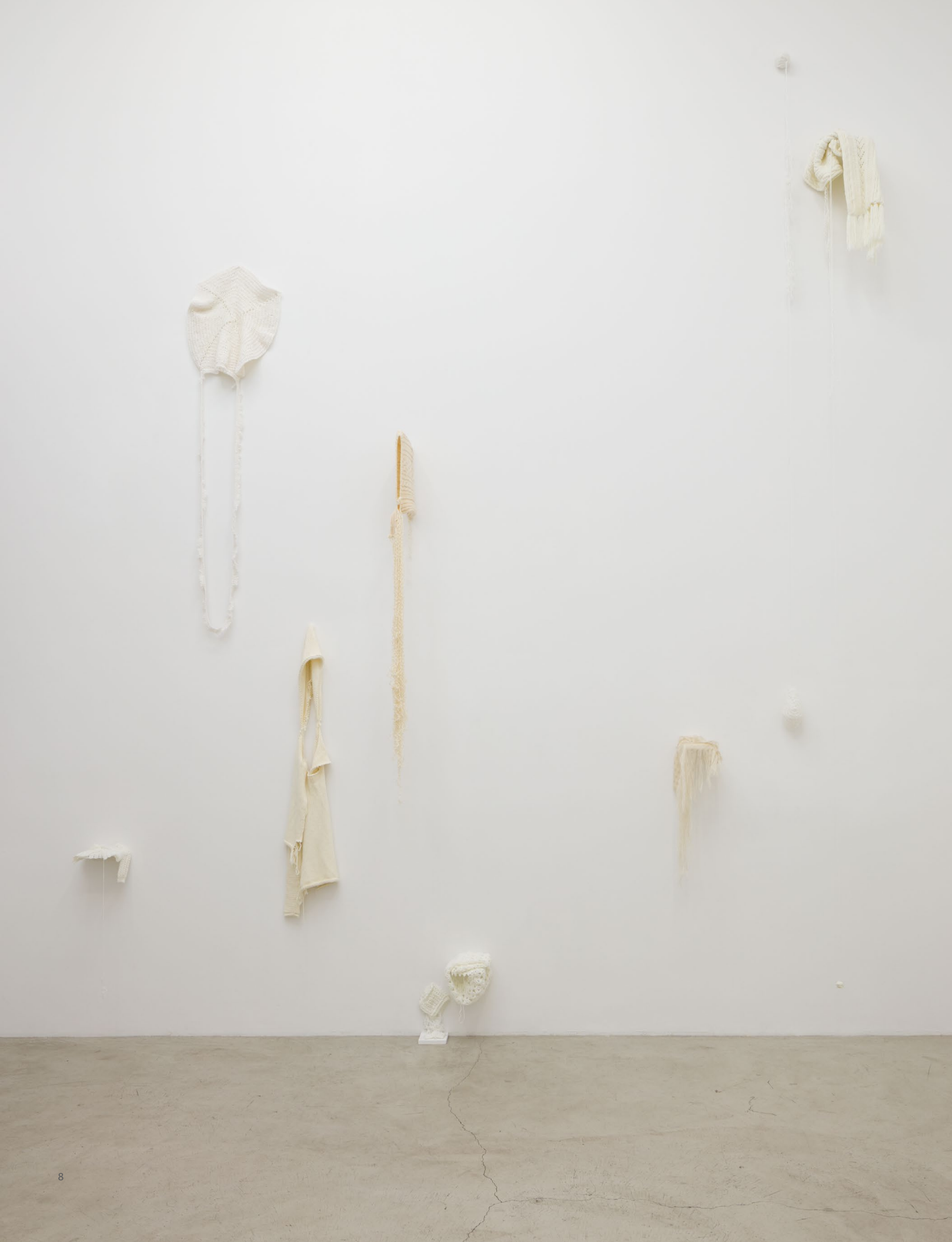
Unravel Installation 2018 Deconstructed hand-knit clothing Varies