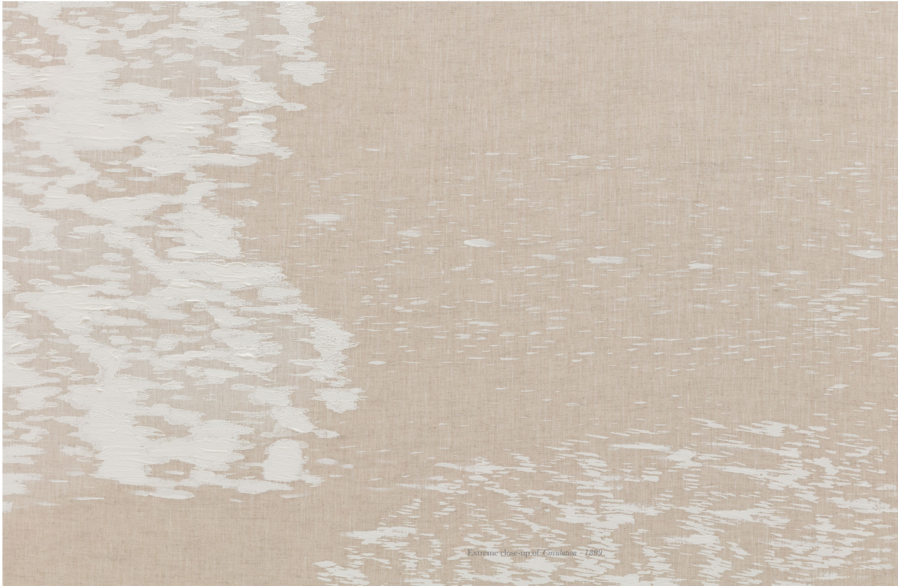
Extreme close-up of Circulation - 1809