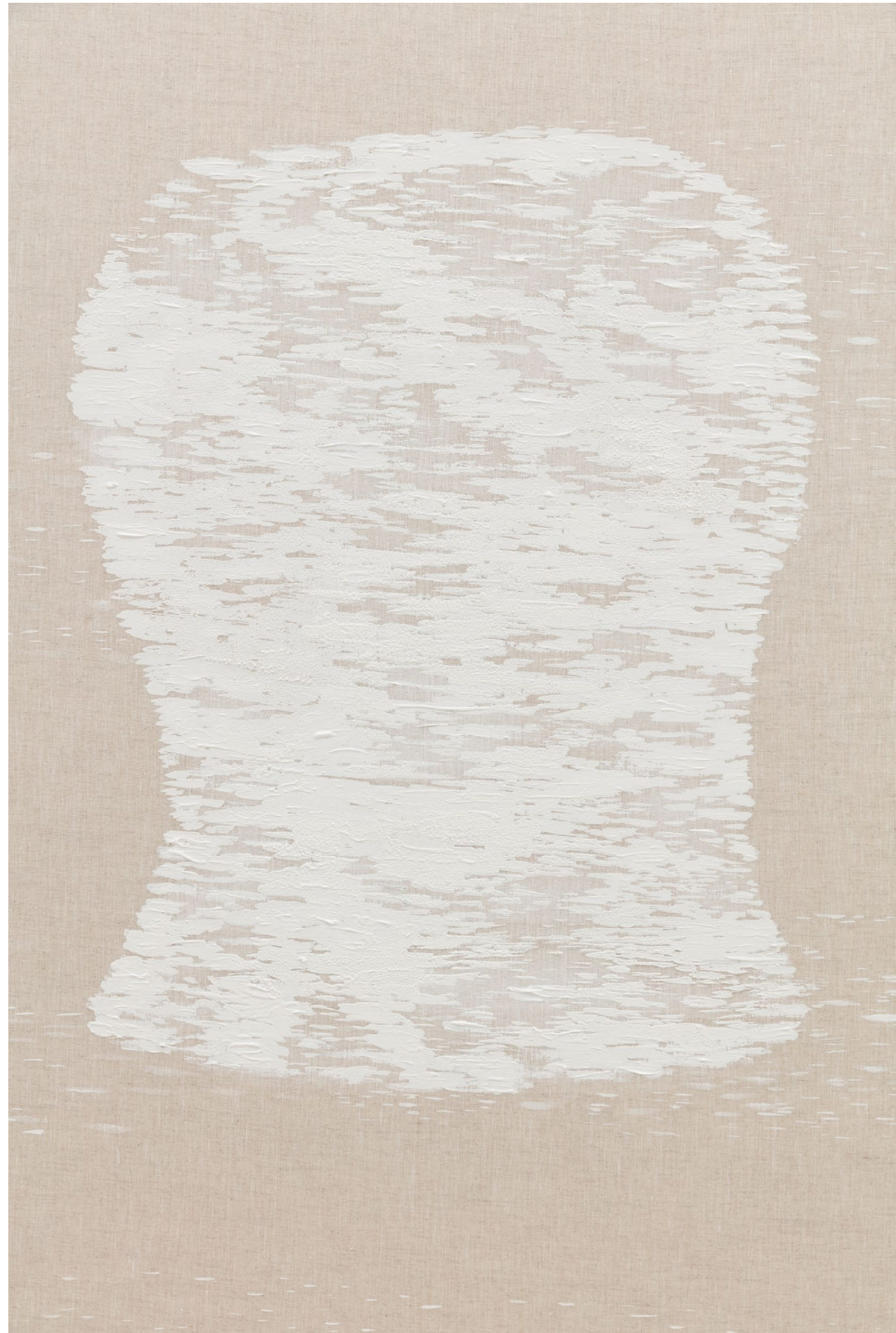
Close-up of Circulation - 1809