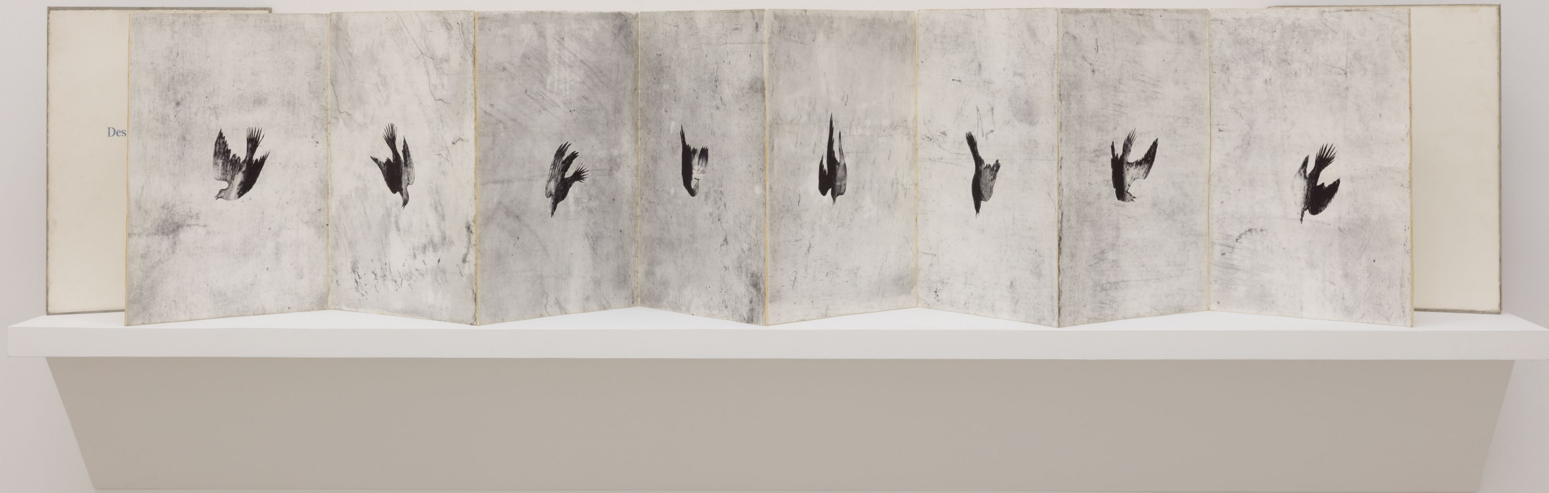
Despair and Hope 1999 Dry-point intaglio print on Fabriano paper 15.3 x 11.4 inches (each panel)