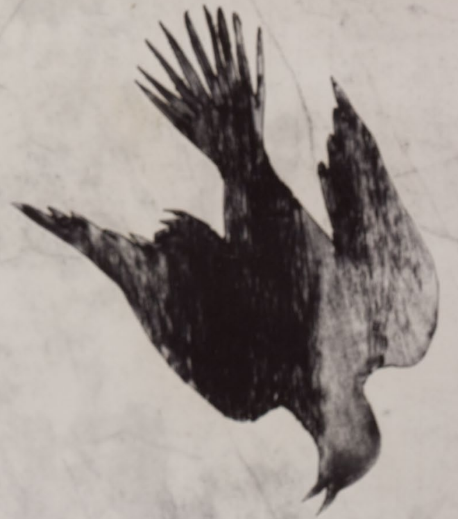
Close-up of Despair and Hope