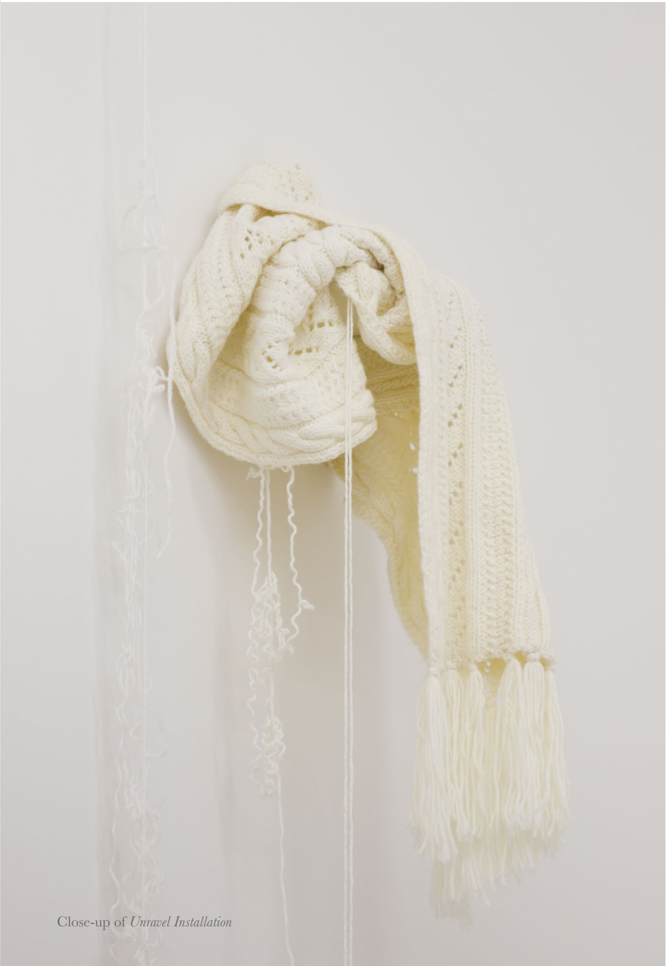
Close-up of Unravel Installation