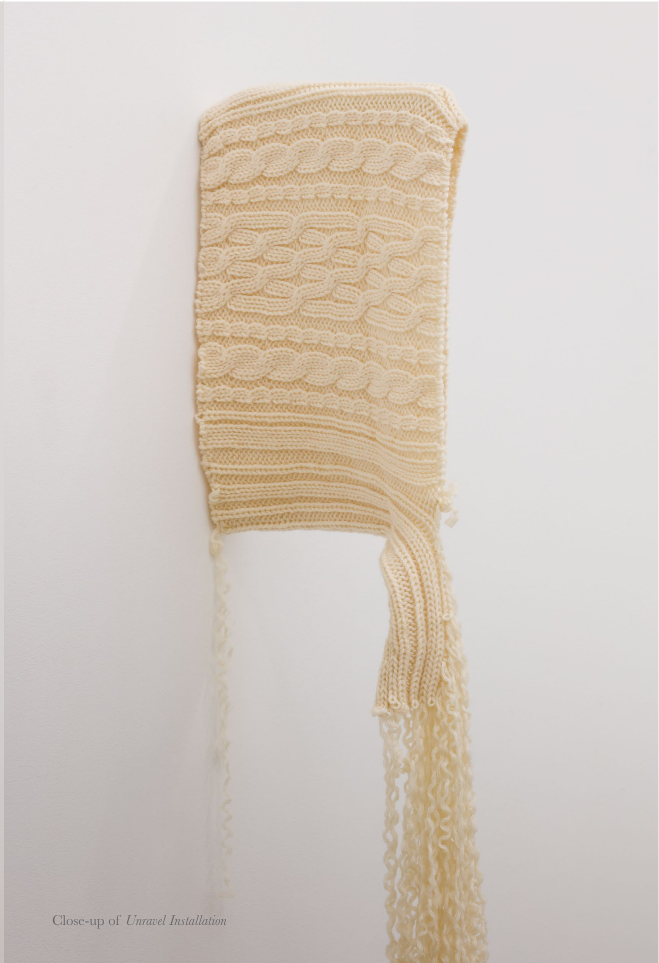
Close-up of Unravel Installation