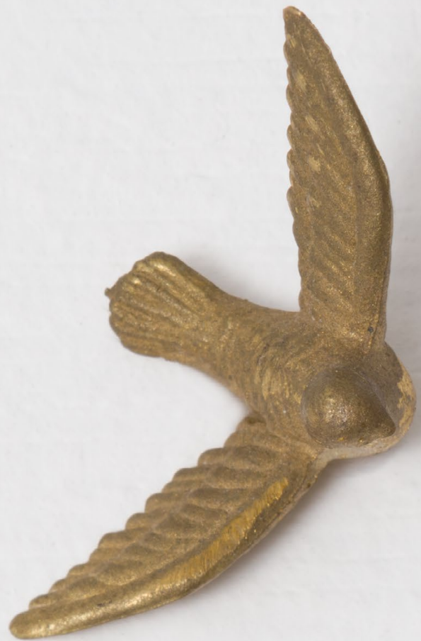
Close-up of Birds