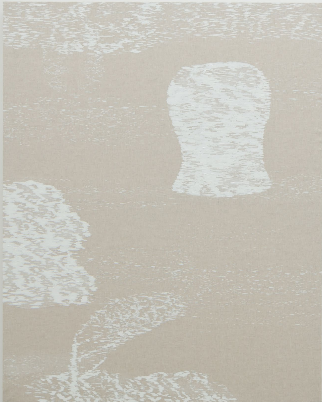
Circulation - 1809 2018 Acrylic on canvas 64 x 50 inches