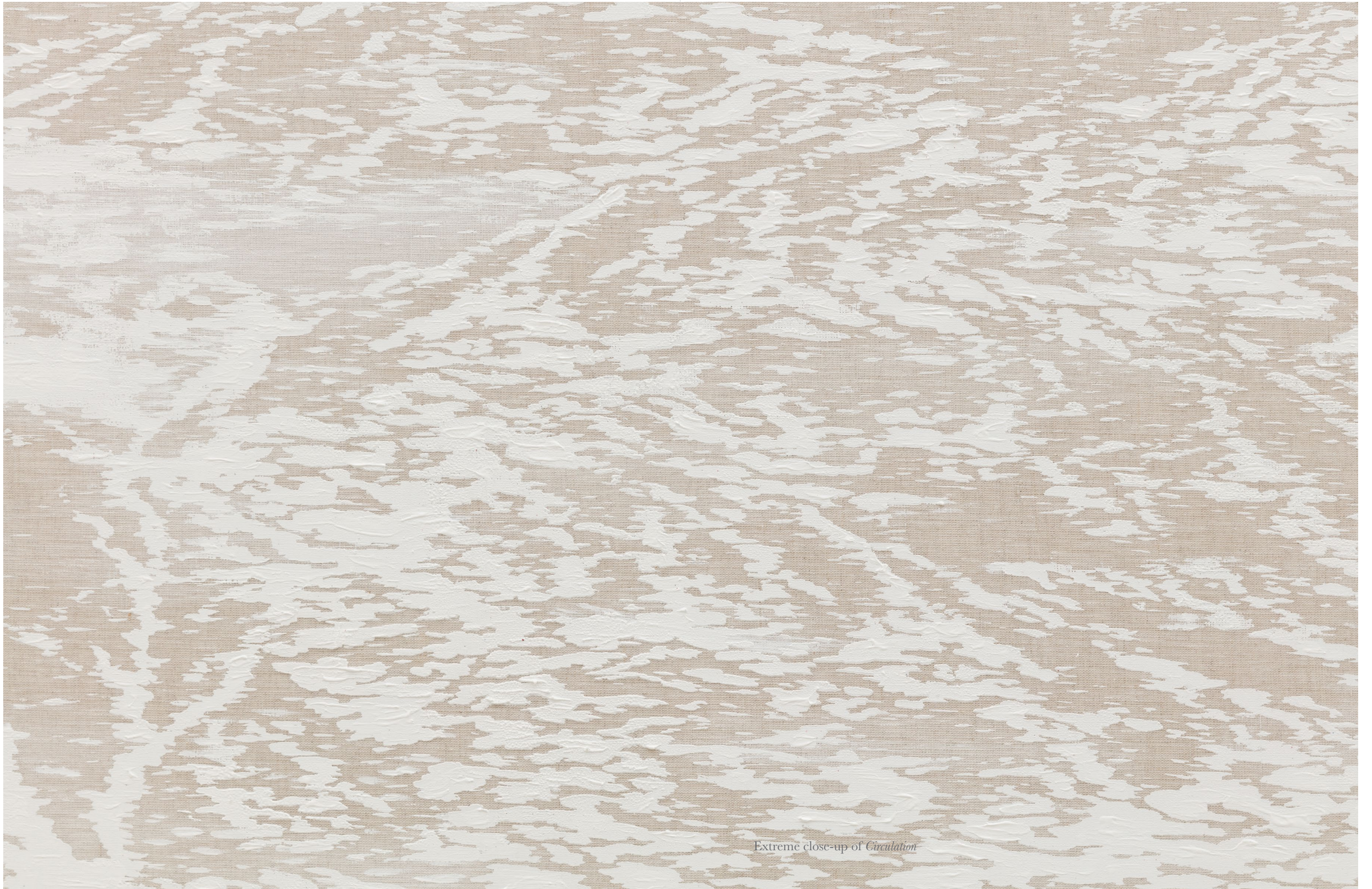
Extreme close-up of Circulation