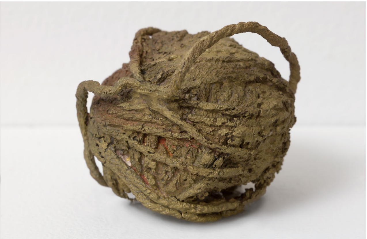
Close-up of Thread Round