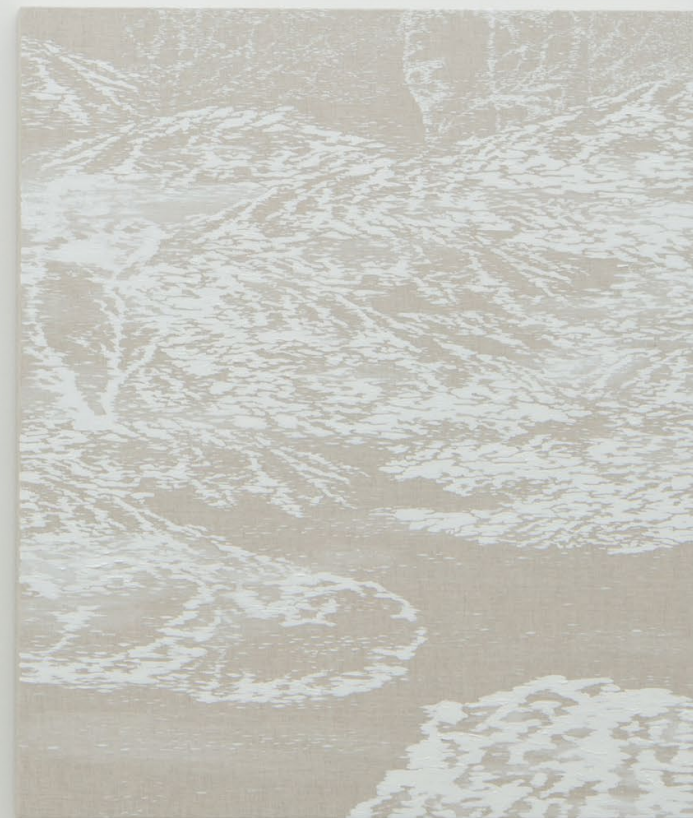
Circulation 2018 Acrylic on canvas 39.5 x 33.5 inches