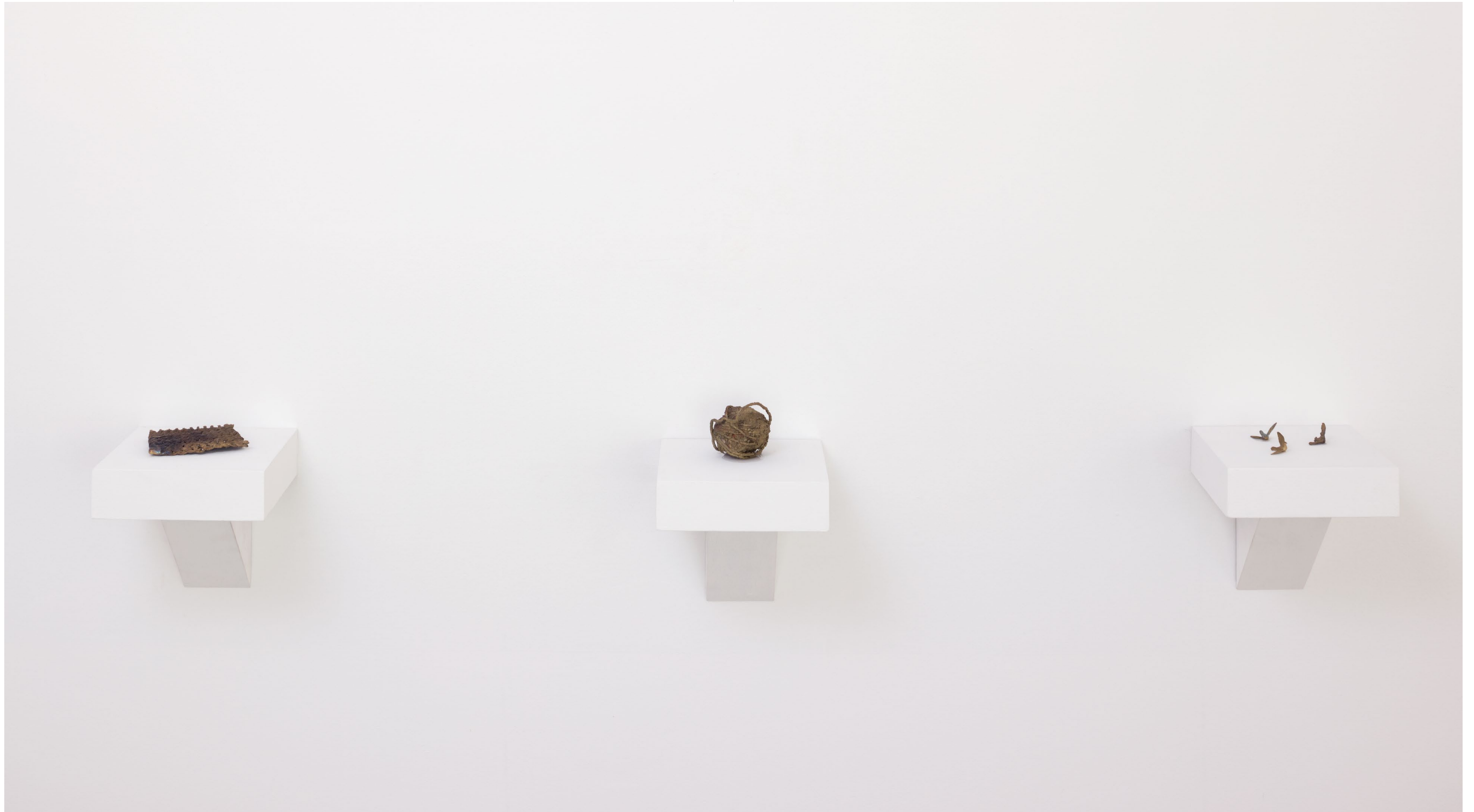
Knitted Piece Bronze