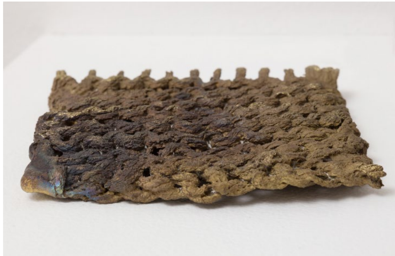
Close-up of Knitted Piece