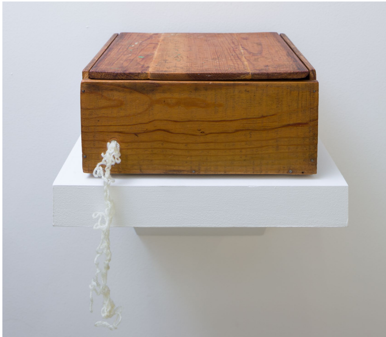
Unravel Installation 2018 Deconstructed handknit clothing Small, Medium, or Large Box